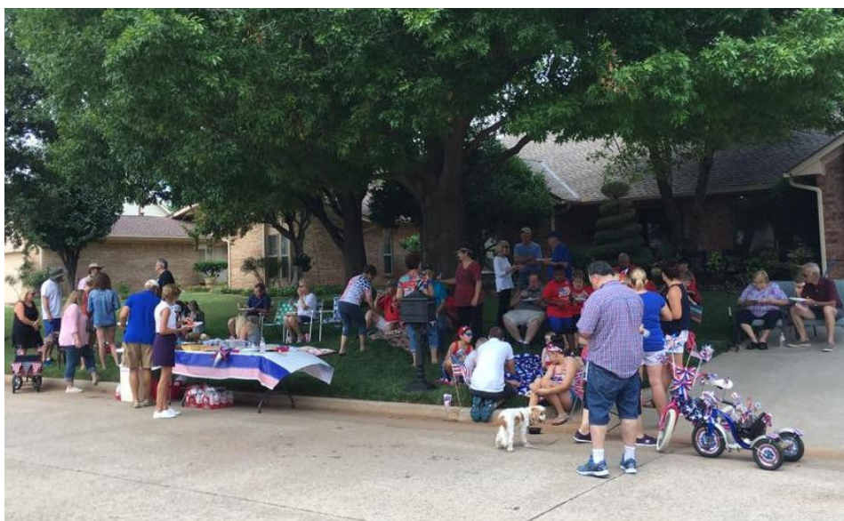
Neighborhood 4th of July Potluck